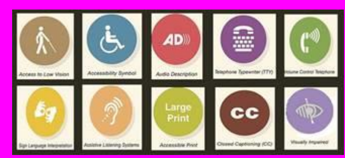
[Image Description: 10 disability symbols, such as low vision, captioning, large print, and audio description.]

This edition's accessibility idea for Deafblind persons is providing transportation to church-related services and events. For some Deafblind persons who have regular and reliable transportation services this may not be needed; however, there may be other Deafblind persons who lack transportation in order to participate more fully in the life of the church. One church in Florida has a coordinator (a church member) who helps to make arrangements for the Deafblind members by working out transportation. The church has a list of reliable volunteers who are willing to bring the Deafblind persons to church-related events. Sometimes, it's a matter of matching communication styles, but personalities too. Help your church to be more welcoming by bringing a Deafblind person.