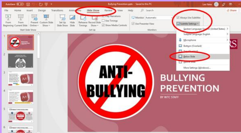
[Image Description: A PowerPoint slide indicating where the captioning feature is located.]

well. To learn more about it, check this out .