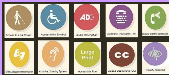
[Image Description: 10 disability symbols, such as low vision, captioning, large print, and audio description.]

This edition's accessibility idea for Deaf and hard of hearing people is the use of captioning during worship . With many churches using multimedia during worship, such as Microsoft PowerPoint 2016, displaying captioning has become much easier. There is no perfect transcription software, but it has become more accurate than ever before. It's a matter of turning your speech into captions that will display at the bottom of the PowerPoint slide. There are multiple languages to choose from as well (e.g. spoken English into Spanish). The feature works with other transcription/captioning software as