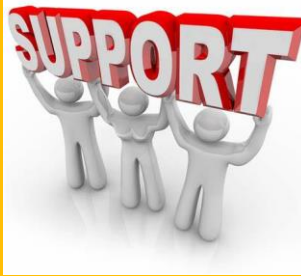
[Image Description: A white background with 3 computer generated persons holding the word "Support."]