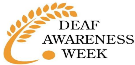
[Image Description: A gold colored leaf with the words "Deaf Awareness Week"]