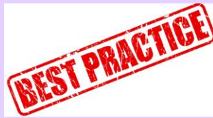
[Image Description: The words "Best Practice" stamped on a piece of paper.]

on the church's website by including details about the ministry (many people check out the website prior to coming).