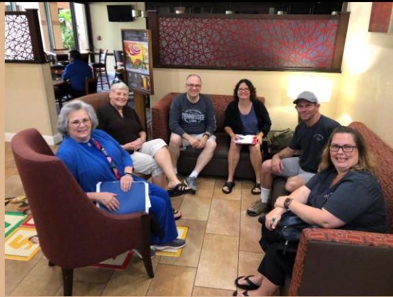
[Image Description: 6 committee members sitting together posing for a picture in the hotel lobby.]