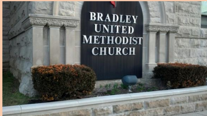
[Image Description: An image of the church with the church sign "Bradley UMC."]

This month's ministry spotlight is Bradley United Methodist Church , a Deaf ministry in Greenfield, IN. The American Sign Language Ministry, the name of their ministry, provides an accessible worship service. The church is committed to making interpreters available during worship and at other events (upon request) by contacting the church office. Also, the church also promotes accessibility for persons with disabilities (differing abilities). In addition, the church collaborates with the ASL program and Interpreting Education Program at Vincennes University.