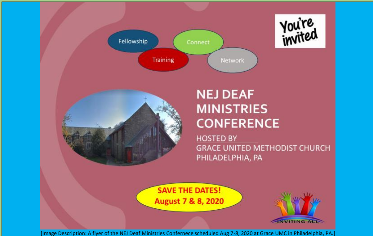
[Image Description: A flyer of the NEJ Deaf Ministries Conference scheduled Aug 7-8, 2020 at Grace UMC in Philadelphia, PA.]