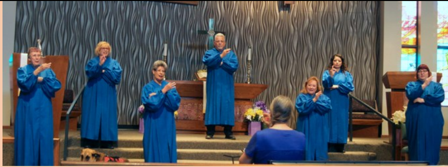
[Image Description: 7 signing choir members dressed in blue robes following/copying a choir director.]

* Highlight your Deaf ministry with us by emailing Rev. Yates at leoyjr@gmail.com .