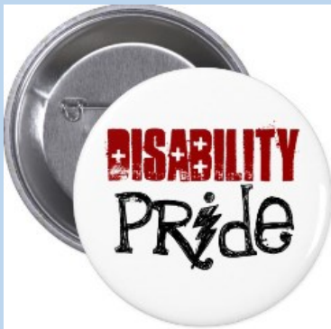
[Image Description: A button with the words disability pride.]

* Note: For those who have disability pride, some see the term differing abilities as a euphemism and feel it can mistakenly cause harm and cause people to have (internalize) shame about their disability. Some feel there is nothing wrong with saying disability and would rather not use the term differing abilities.