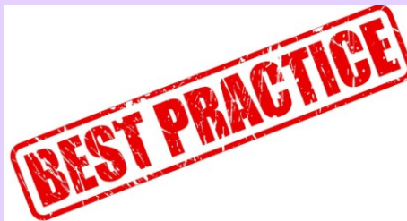
[Image Description: The words "Best Practice" stamped on a piece of paper.]

Being a Deaf ministry ambassador is this month's Deaf ministry best practice. Everyone who is involved in Deaf ministry ought to be an ambassador who helps to promote and bring visibility to Deaf ministry. As an ambassador, we should be ready to: speak about Deaf ministry, be advocates or allies, raise awareness about communication access (like point out barriers & recommend solutions), share resources (e.g. where sign language classes are offered or a book about Deaf ministry), plant seeds/ideas to other churches to begin a Deaf ministry (or at least how to improve communication access), know some of the history of your church's Deaf ministry, and among other ambassador responsibilities. Remember, the Apostle Peter said to always be ready to give a testimony. "Always be ready to answer everyone who asks you to explain about the hope you have" (1 Peter 3:15 ICB). Being a Deaf ministry ambassador isn't only for leadership, it's for everyone who is involved in and/or supports the church's Deaf ministry. So, put your Deaf ministry ambassador hat on and get to work!